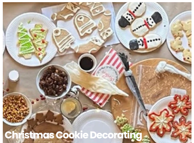
Christmas Cookie Decorating