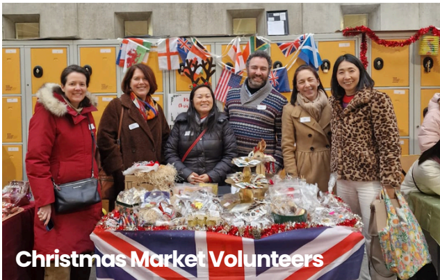
Christmas Market Volunteers

Coffee Morning: Monday 10 March, hosted by Nora Barendson